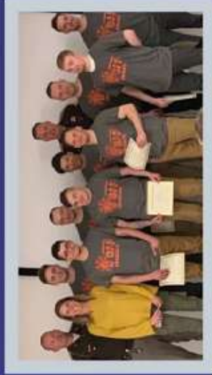
Proud JCAP graduates