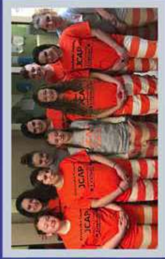
Proud JCAP Graduates