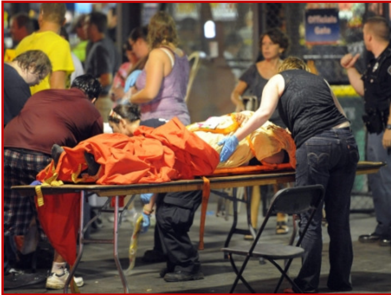
August 14 th 2011 Indianapolis Stage Collapse